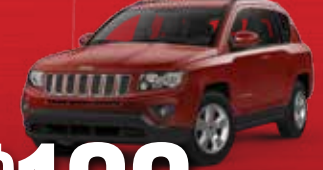
2016 JEEP COMPASS