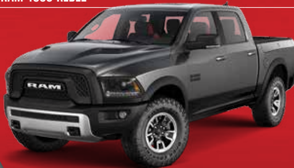
2016 RAM 1500 REBEL

ABC MOTORS' BIGGEST EVENT OF THE YEAR IS HAPPENING RIGHT NOW. OVER 100 NEW AND USED VEHICLES WILL BE RED TAGGED WITH OUR LOWEST PRICES OF THE YEAR.