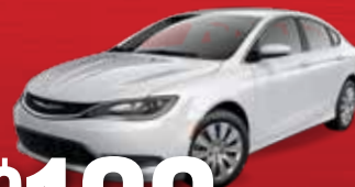
2016 CHRYSLER 200

ABC MOTORS 12345 MAIN STREET ANYTOWN, STATE