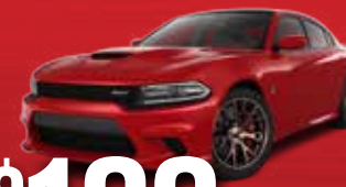
2016 DODGE CHARGER